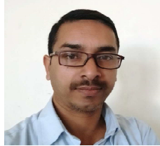
By: M.R. Lahu

Does prayer work as a weapon? This question has many queer elements to it as it is a totally different perspective on prayer. With millions of people across the globe resorting to pray in different ways and fashions, prayer has become an indivisible part of human existence. There are many who don't believe in prayer or praying for them is detrimental. But to see prayer as a weapon that fights all the odds and adversities of life should be an intrinsic approach. Enmeshed in life's complexities and perplexities and chaos, prayer brings little solace to the soul and a compassionate approach with a prayerful vocabulary on vitriolic elements gives us inner peace. I personally believe that prayer should not be seen as a religious affair. Every religion does have a systematised manner in which it initiates prayer. But to me prayer is a relentless surrender to an entity that holds control over everything, which you may call almighty. Starting from the Vedic period of Yajnas to the inner spiritual splendour of the yogis, prayer and its outcomes existed in various forms.